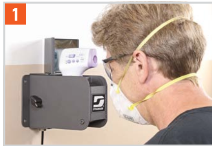
1 - Place forehead in front of thermometer