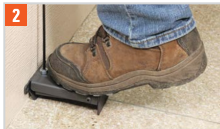
2 - Place foot on activation button